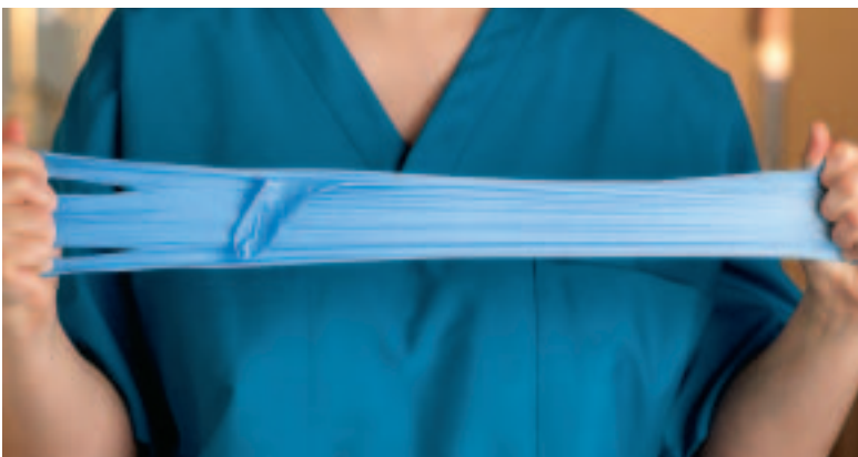
Added stretch provides added comfort when donning and wearing

Esteem® Stretchy Synthetic is for short-term use (<15 minutes) where there is minimal stress and low to no risk of exposure to blood or other potentially infectious materials.